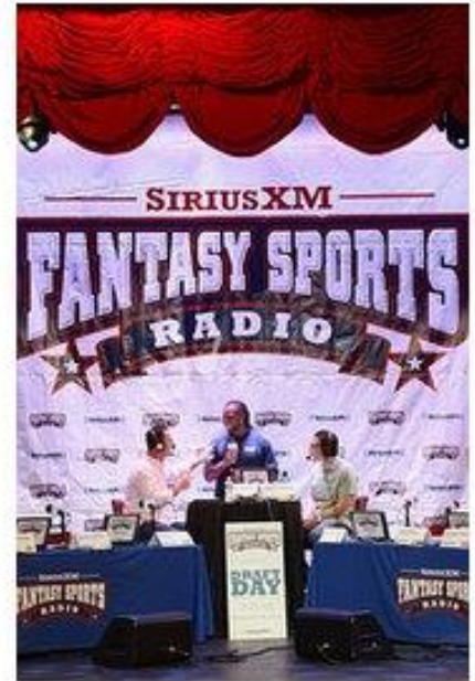
NEW YORK, NY - JULY 17: (L-R) Former Professional Football player Rich Gannon, Professional Football player Larry Fitzgerald, and SiriusXM radio host Adam Schein attend

I'm a traditionalist when it comes to my football tastes. I still watch NFL games because of an interest in the teams and the outcome of the game. For millions of others, their NFL interest centers in part or in whole on the statistical production of individual players that make up their fantasy teams. Any visitor to websites like Yahoo Sports or ESPN will find an extensive number of articles focusing on fantasy